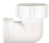
T4U 90 degree Bend 1 1/2" Female inlet x 1 1/2" BSP Male Connector to suit Macvalve-2