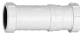
MACVALVE-20 2" Universal Inlet & Outlet Self Sealing Trap