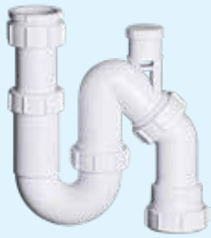
SP40AV - 40mm trap