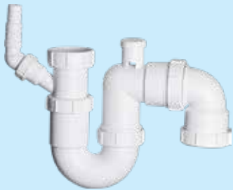
SP50AV - 50mm trap