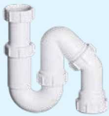
TP10 - 1 1/2" tubular swivel (in S trap swivel position)

Amazingly adjustable for easy installations