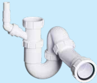
ZP10WM - 2" with dishwasher connection (in Q trap swivel position)