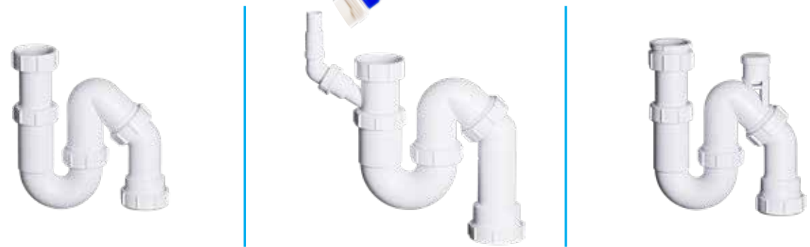
TP10 1 1/2" Tubular Swivel All One Trap