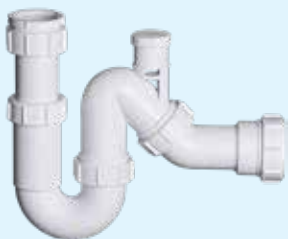
SP40AV - 40mm with AAV (in P trap swivel position)